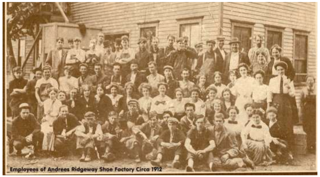
Ridgway & Son Shoes was the major employer in Delanco for many years. This annual photo of Ridgway's employees was taken about 1912 in front of the original frame factory building.