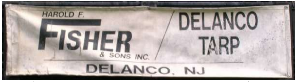
Vinyl sign from the company truck showing both operating names. Peter Fritz photo from 2007.

Photo of a shoe actually manufactured by Ridgway & Son Shoes. The shoe is from the collection of Vincent Colonna. The shoemaking equipment was borrowed for the display.