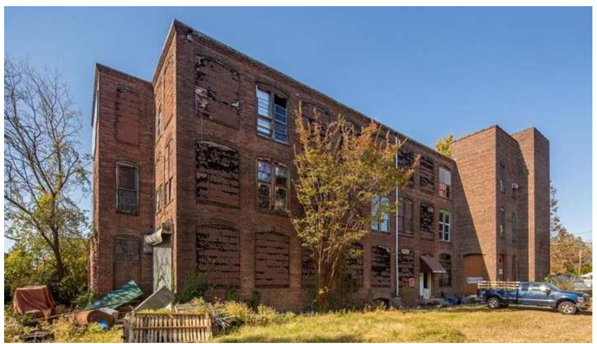
This photo from Bright MLS shows the recent condition of Fisher & Son Canvas when it was still in operation. The original powerplant building and coal shed has long since been demolished and many of the windows have been boarded up. The main entrance is indicated under the awning next to the freight elevator. A bay door can be seen to the rear (south side) of the factory.

Fisher & Son Canvas moved to Cinnaminson in 2018.