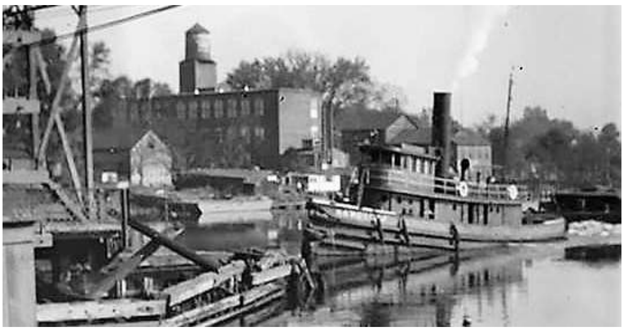
This photo, taken some time after 1912, shows the orientation of the original frame factory building and its addition in relation to the newer frame factory. Borel's boatshed is to the left of the factory. In the foreground is the steam tug Rancocas with a barge in tow, heading downstream toward the swing bridge. This was a busy time for commerce along the Rancocas Creek, when the waterway was a major asset to the growth and prosperity of Delanco.