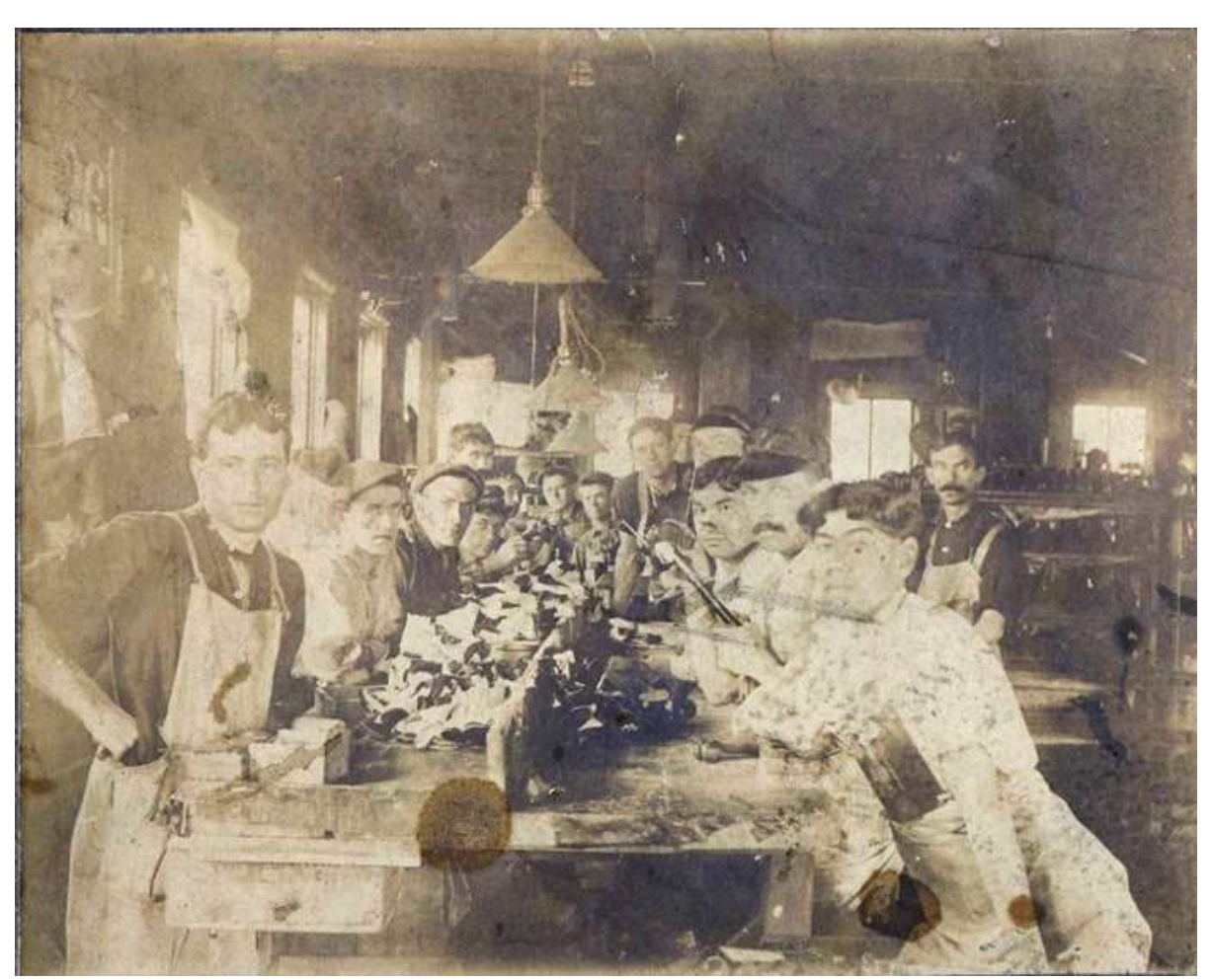
In this photo, the employees appear to be taking a moment from their hard work manufacturing shoes for children and infants. The photo appears to have been taken in the original frame factory building, which would date it between 1885 and 1912.