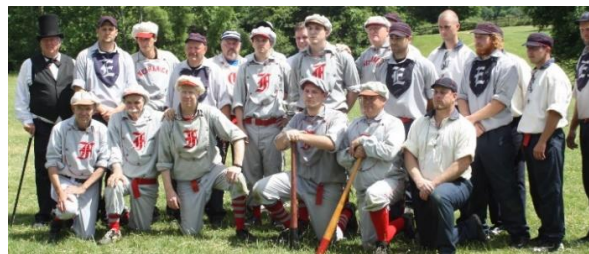
Flemington Neshanock Base Ball Club