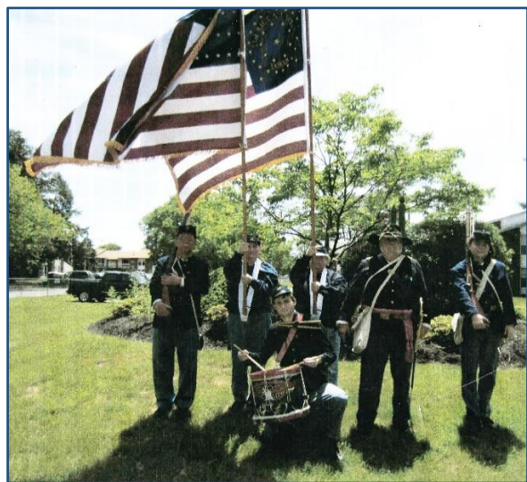
Featuring the 23rd NJ Regiment Volunteer Infantry –The “Jersey Yahoos” Color Guard

Family Activities; History Displays, Pageantry, Special Guests, Music and more!