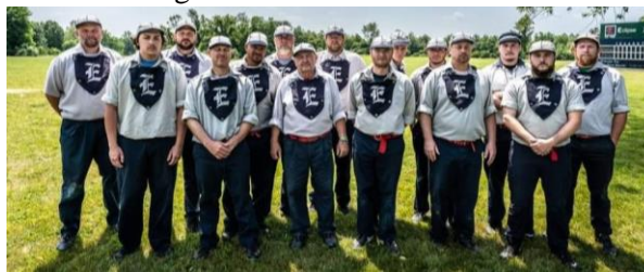
Elkton Eclipse Base Ball Club of Elkton, MD.

Babe Ruth Day is sponsored by The Delanco History Board and Delanco Recreation Commission with support from Delanco Township