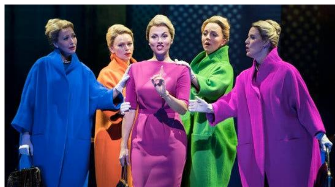
Marnie- Based on the same source as Hitchcock's movie! June 27, 2024