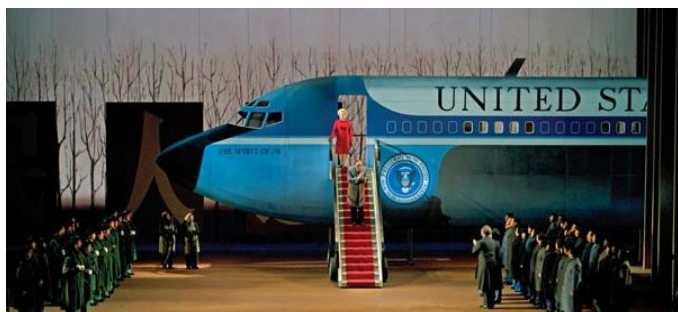
Nixon in China- (Yes, that guy.) June 6, 2024

All American Opera classes are 6:30 to 8:30 PM in-person and simultaneously via Zoom Summer 2024 Registration is Open---There are more than 35 different classes in addition to this one, To register for classes, click here: https://www.rcbc.edu/senior