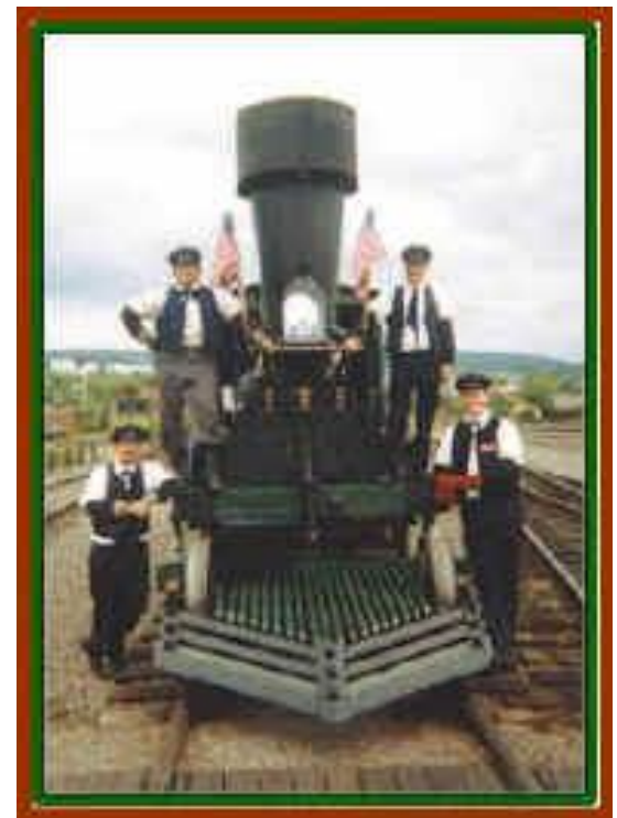
John Bull locomotive, Camden & Amboy Railroad that established service here in 1834.

Delanco History Board Members, Associates & Friends of Delanco History